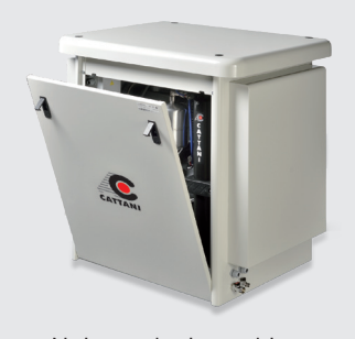
Noise reducing cabinet Product Code: 010800