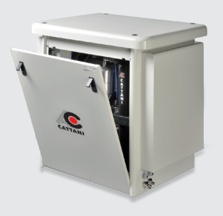
Noise reducing hood