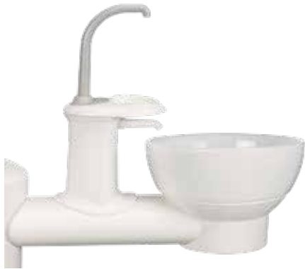
Fixed glass cuspidor