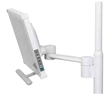
Light monitor mount with link arm