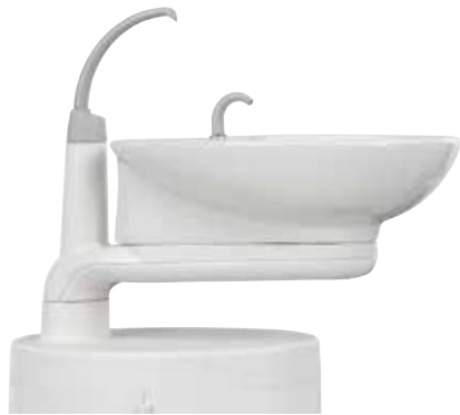
Rotating vitreous china cuspidor