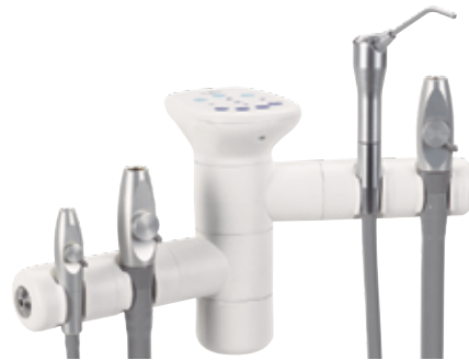
Dual 2-position holder