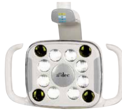
A-dec 500 LED