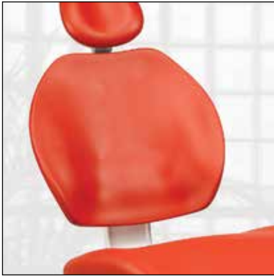
Formed upholstery without armrests