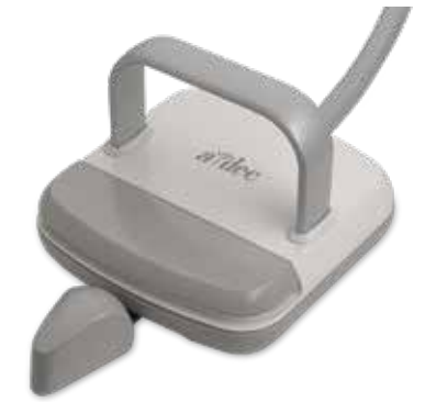
Lever foot control