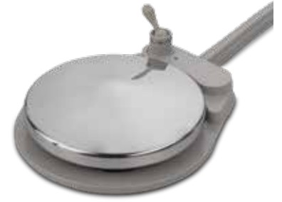
Disc foot control