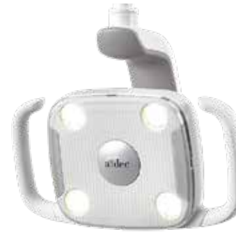
A-dec 300 LED