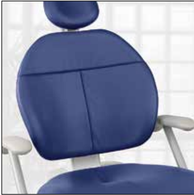
Sewn upholstery with armrests