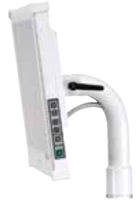
Radius monitor mount