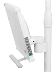
Light monitor mount